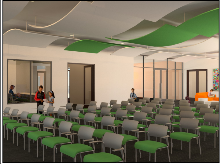
Multipurpose room connected to the school. This room could be used for larger events for both the school and RE programs such as talent shows, art displays or parent meetings. It can also be used as a lunchroom when the gym is not available, and as our storm shelter. (2,638 sq. ft.)