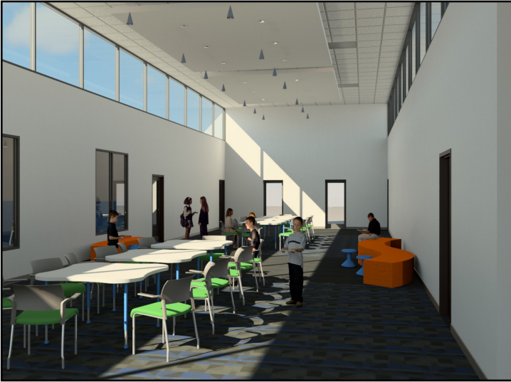
School commons areas/hall that is looking west. (3,112 sq. ft.). The classrooms (not pictured) will be similar but larger than our current classrooms (650 sq. ft.) and average approximately 1,175 sq. ft.