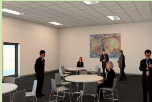
TOP LEFT: This represents our overflow area and what you will see during Mass. It will seat 250 additional people for Masses and double as two extra parish meeting rooms. (1,972 square feet)